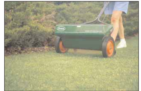
Figure 4. Drop-type spreaders allow precise placement of insecticide granules.

walks. Drop-type spreaders are less likely to scatter pesticide granules off of the target site than are rotary-type spreaders (Figure 4). Pesticide runoff from improper pesticide applications reduces the effectiveness of a treatment and can pollute above-ground and underground water supplies.