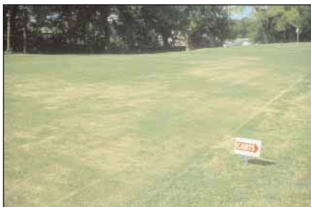
Figure 1. Golf course fairway damaged by white grubs.

White grubs, sometimes referred to as grubworms, injure turf by feeding on roots and other underground plant parts. Damaged areas within lawns lose vigor and turn brown (Figure 1). Severely damaged turf can be lifted by hand or rolled up from the ground like a carpet.