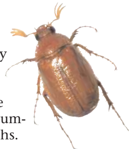
Figure 2. Adult white grubs, often called May or June beetles, are commonly attracted to lights at night.

The most important turfgrass-infesting white grubs in Texas are the June beetle, Phyllophaga crinita (Figure 2), and the southern masked chafer, Cyclocephala lurida . Warm season grasses like bermudagrass, zoysiagrass, St. Augustinegrass and buffalograss are attacked readily by both types of white grubs, with most lawn damage occurring during summer and fall months.