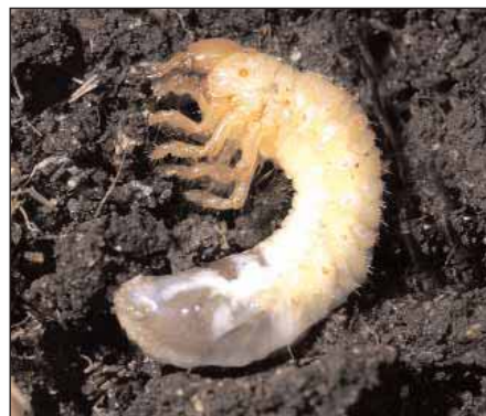
Figure 3. Turfgrass-infesting white grub larvae feeding on grass roots. Grubs are most damaging when they reach a length of \frac{1}{2} - to 1-inch.

Larva. White grub larvae are creamy white and C-shaped, with three pairs of legs (Figure 3). After hatching, the white grub passes through three larval life-stages, or instars. These instars are similar in appearance, except for their size. First- and second-instars each require about 3 weeks to develop to the next life-stage. The third-instar actively feeds until cool weather arrives. Third-instar larvae are responsible for most turfgrass damage due to their large size ( \frac{1}{2} to 1 inch-long) and voracious appetites. Feeding by large numbers of third-instar white grubs can quickly destroy turfgrass root systems, preventing efficient uptake of food and water. Damaged turf does not grow vigorously and is extremely susceptible to drying out, especially in hot weather.